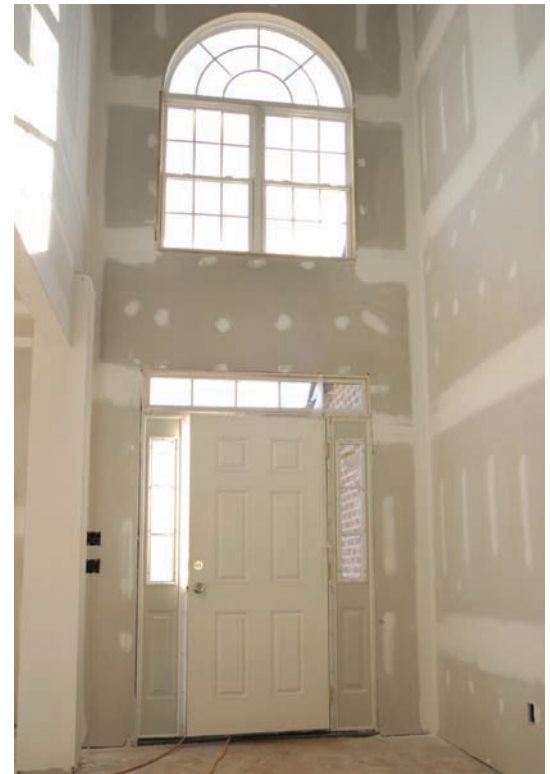
CDScan™ measures very low levels of airborne contaminants from contaminated drywall before they become an issue.

This two-part test measures for airborne chemical markers and corrosion markers that suggest there is a problem in the home. Together, these sets of markers are able to provide a higher level of certainty that contaminated drywall is in the home compared to single test kits.